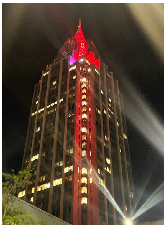
Mobile RSA Tower