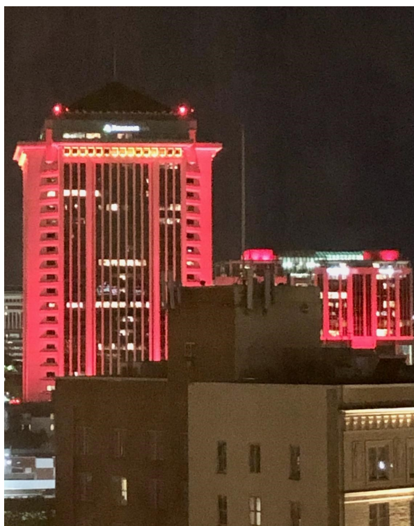
Montgomery RSA Tower